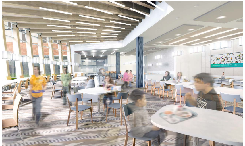
Common Dining Area

Estimated building completion and occupancy