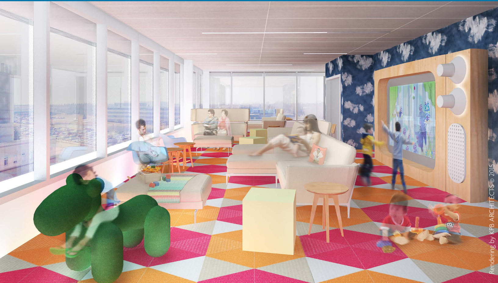
Rendering by KPB ARCHITECTS © 2015

Our Vision: Alaska Native people are the healthiest people in the world.