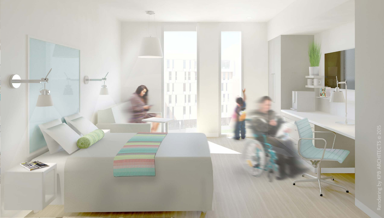
Rendering by KPB ARCHITECTS © 2015

Our Vision: Alaska Native people are the healthiest people in the world.