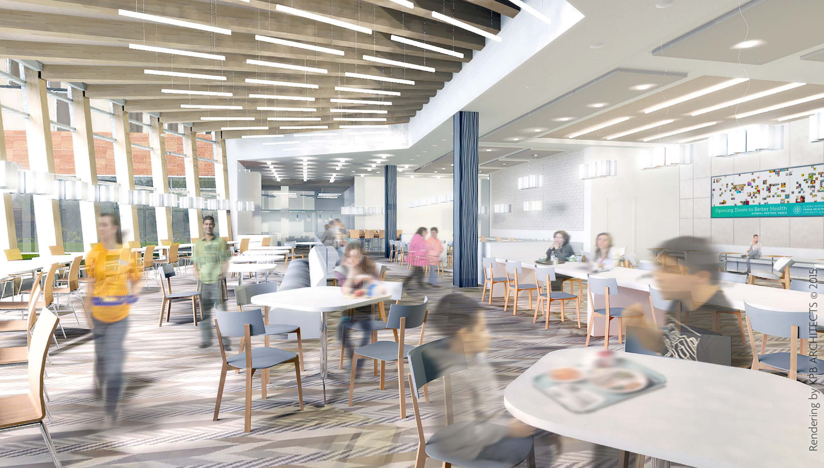
Rendering by KPB ARCHITECTS © 2015