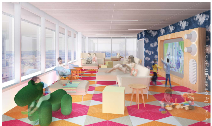
Maternal Family Services living room