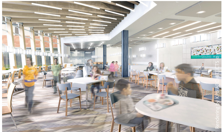
Common dining area

Estimated building completion and occupancy