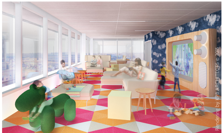
Maternal Family Services living room