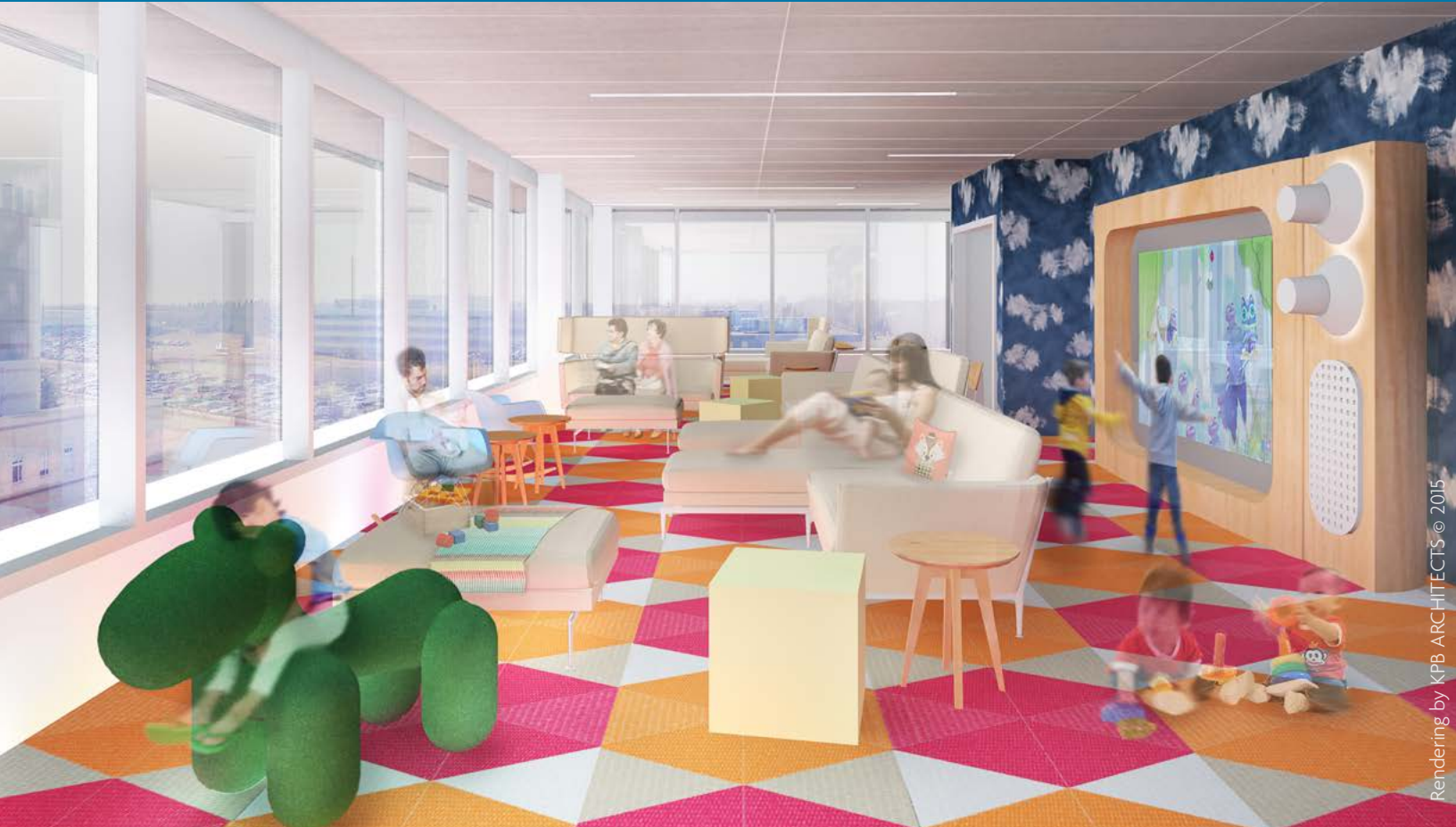
Rendering by KPBB ARCHITECTS © 2015

Our Vision: Alaska Native people are the healthiest people in the world.