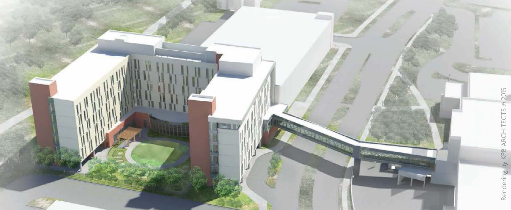
Rendering by KPB ARCHITECTS © 2015