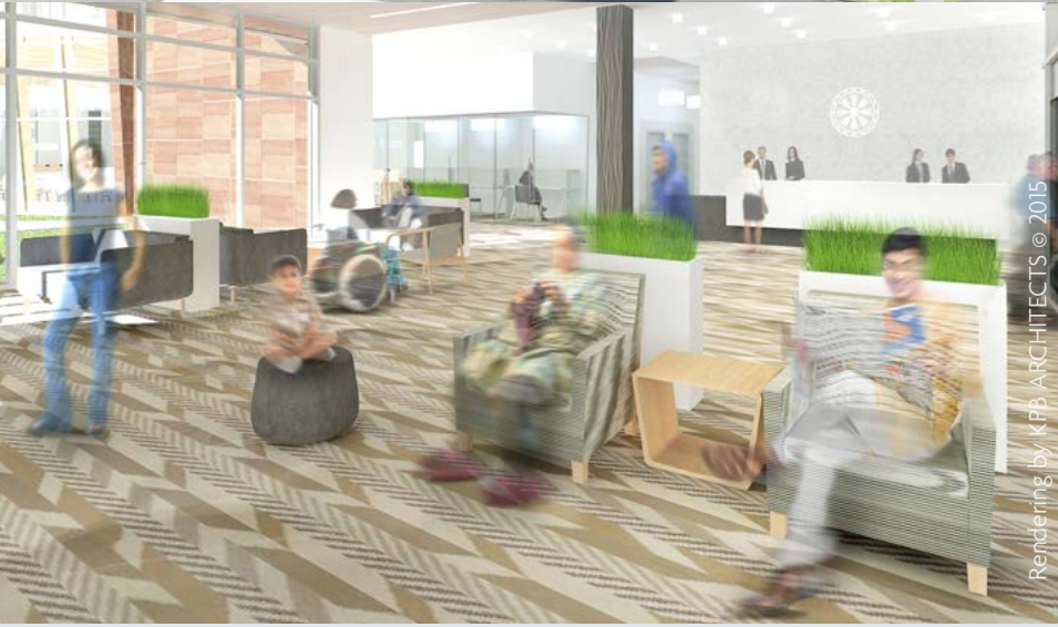
Rendering by KPB ARCHITECTS © 2015